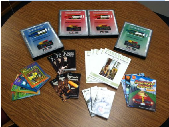
Some of the items purchased for this year

The students have enjoyed learning from the new curriculum and have even used it to model their own social skills videos.