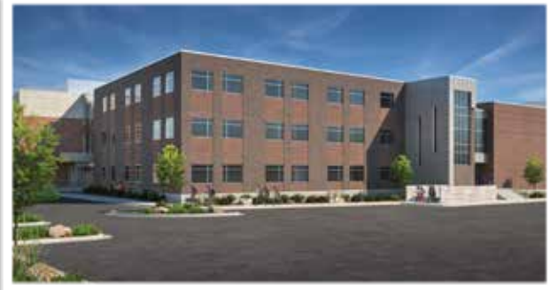
Rendering of the new classroom wing, with 22 classrooms to be completed in Spring 2020