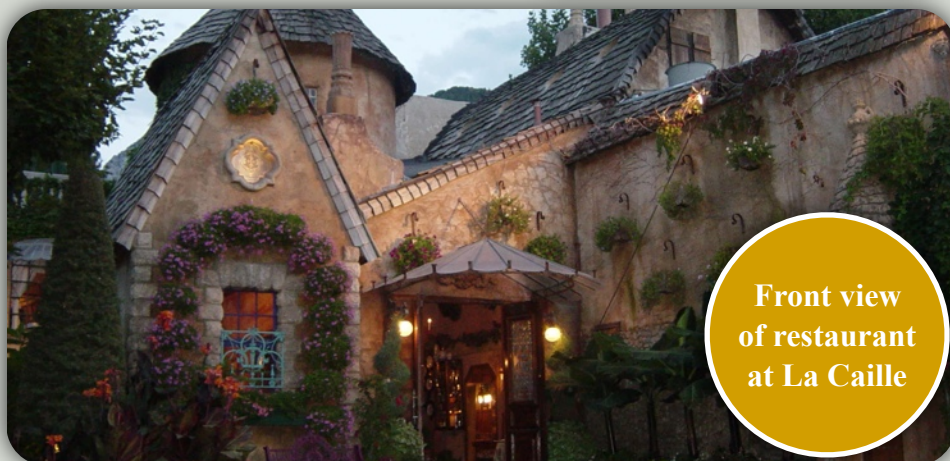
Front view of restaurant at La Caille