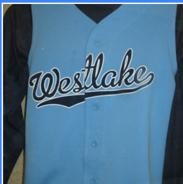
Top: Westlake Girls Soccer tryouts were held on Friday.