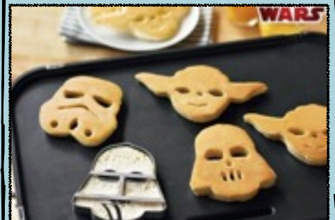
Star Wars Pancake Molds