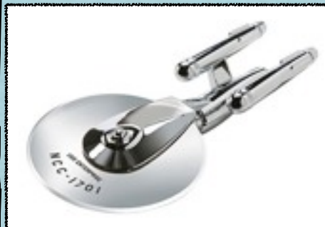
Star Trek Pizza Cutter