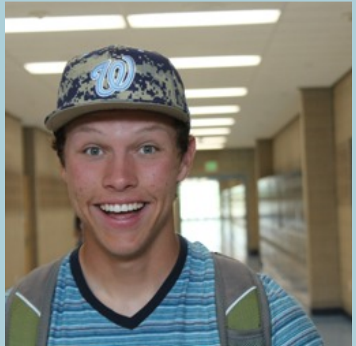
Mitchell Byrd School Spirit