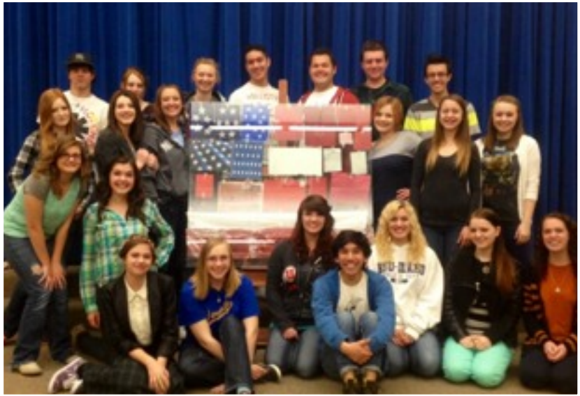
*This is also the One-Act Play group, no pictures of the musical theater group were available at time of publication.

entertaining, informative, or inspiring, and if the portray realistic characters through content of the play's material.